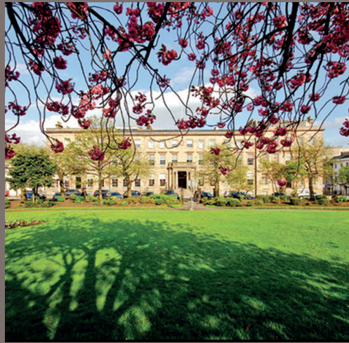
Blythswood Square, Glasgow