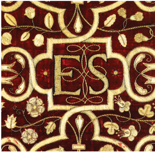
Applique embroidery on red velvet with Bess of Hardwick's monogram