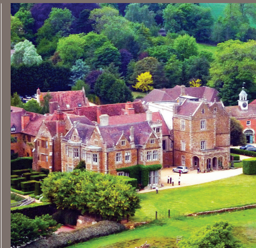
Fawsley Hall, Northamptonshire