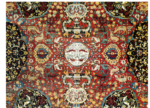
The Salting Carpet (detail), central Iran, 16th century. V&A collections