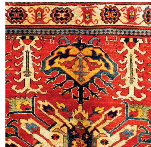
Eagle Kazak, south Caucasus, circa 1800. V&A collection at the Clothworkers' Centre, Blythe House