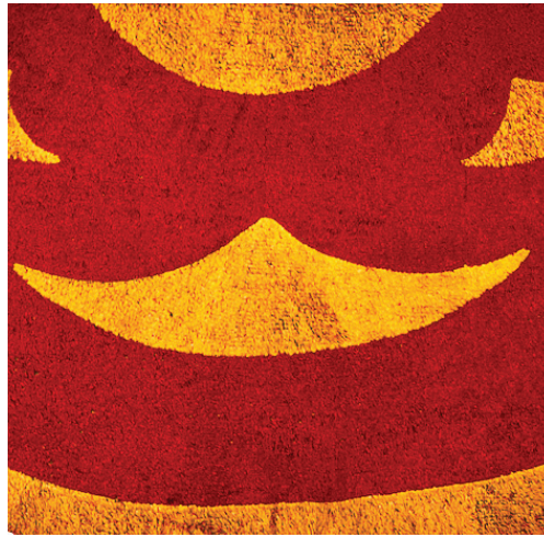
A red and yellow feather cloak from the Hawaiian Islands, on display at the Pitt Rivers Museum, Oxford

Optional visit to local rug gallery and free time in Oxford.