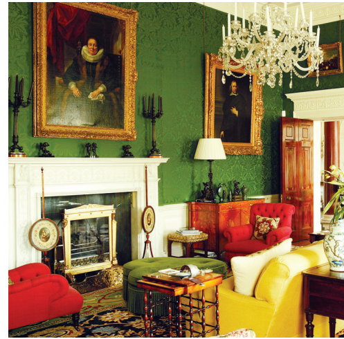
The Faringdon collection includes paintings by Edward Burne Jones Rembrandt, Rubens and Van Eyck