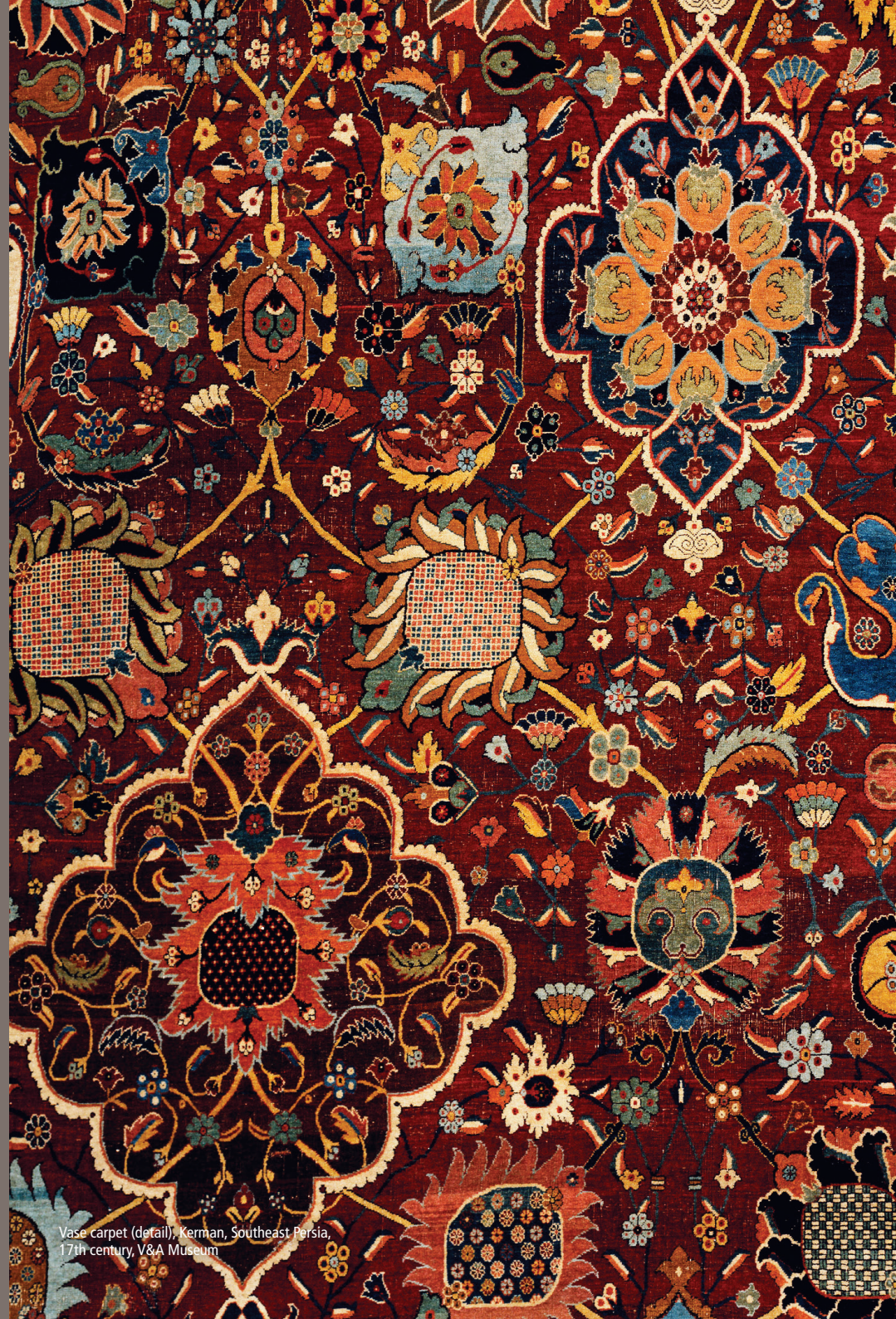
Vase carpet (detail), Kerman, Southeast Persia, 17th century, V&A Museum

A copy of the full terms & conditions will be included as part of the booking form.