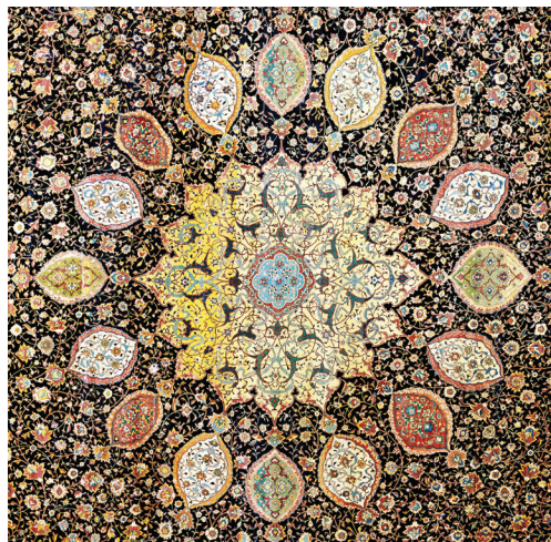
The Ardabil Carpet in the V&A Islamic Galleries

The tour provides opportunities to explore the cities themselves, with several evenings left free for your own enjoyment.