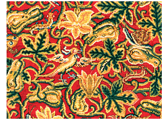
The Chaloner Carpet (detail), England, circa 1600. The Burrell Collection