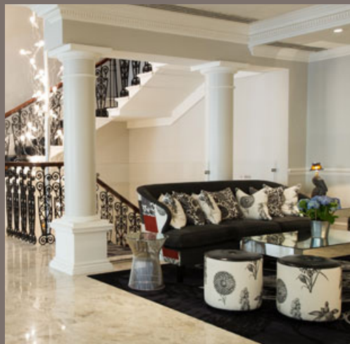
The Ampersand Hotel, London

HALI will offer you the ultimate, unforgettable British experience.