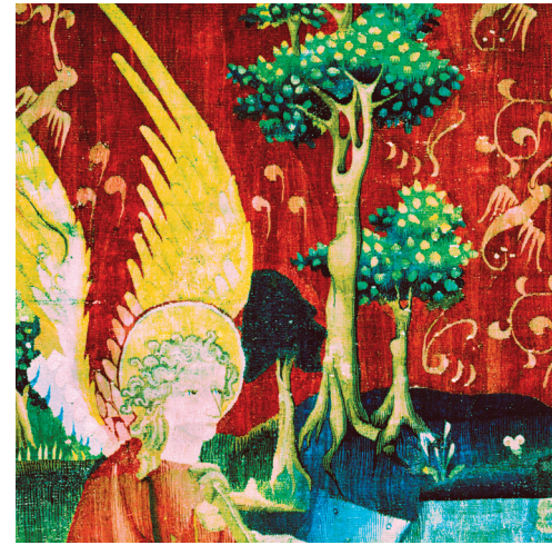
Fragment of an Apocalypse tapestry, France, ca. 1375-8. Burrell Collection