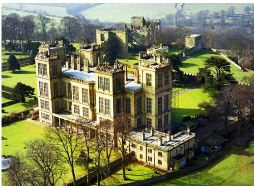
Hardwick Hall, Leeds

Lunch at The Great Barn restaurant at Hardwick Hall; alternatively guests can picnic in the grounds.