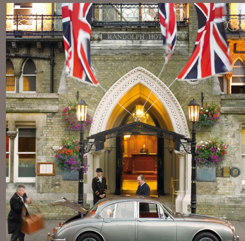
The Macdonald Randolph Hotel, Oxford