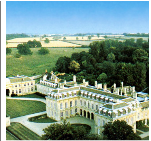
Boughton House, home to one of the UK's most important collections of carpets

Travel to Fawsley Hall, Northamptonshire via Oxfordshire villages for special lecture and Gala dinner in the outstanding restaurant at the largely Tudor hotel (with Victorian and Georgian additions), which has extensive gardens and grounds designed by Capability Brown in the 19th century.