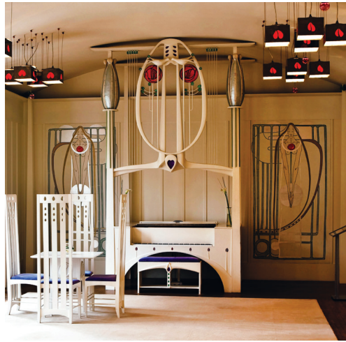
Rennie Mackintosh's House for an Art Lover in Glasgow