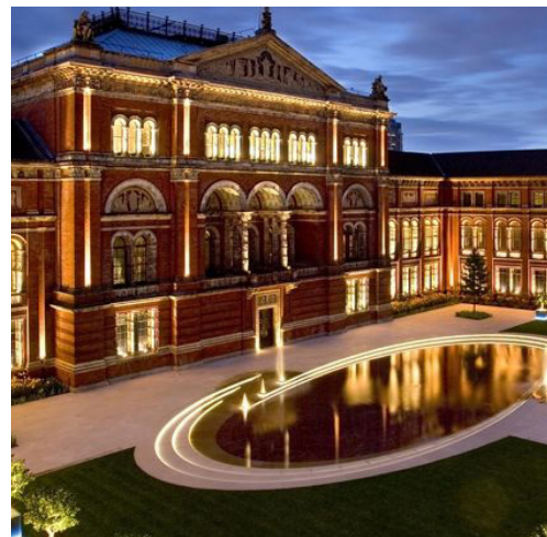
The John Madejski Garden at the V&A, London

Welcome drinks reception in The Library at The Ampersand Hotel followed by dinner.