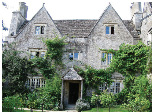
Kelmscott Manor, country home of 19th century designer, William Morris

Dinner will be hosted by HALI in a traditional English country pub. Return to Oxford via Cotswold villages.