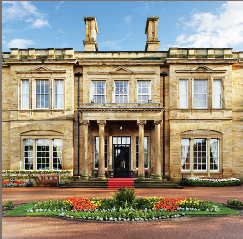
Oulton Hall, Leeds