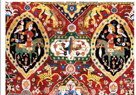
Detail from the 16th century Persian 'Sanguszo' carpet at Boughton

Buffet lunch at the house, followed by a tour of the restored parkland, gardens (which should be in full bloom) and an ancient lily pond.