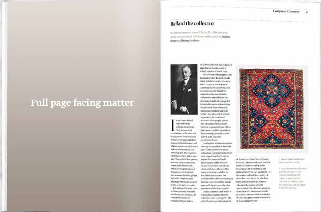
Full page facing matter