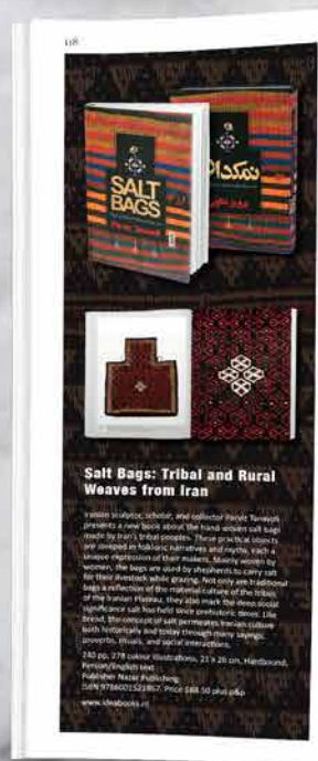
Half page vertical facing matter